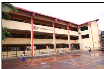
125 th Jubilee Building(old Tuck Shop)