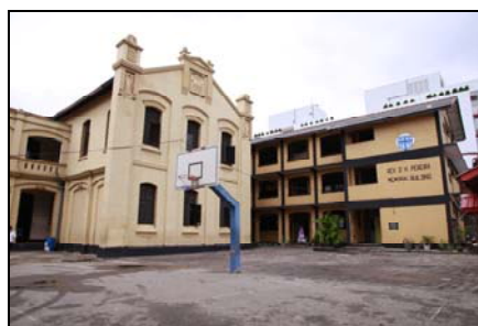
The Old Junior Wing(now 3 storeys)