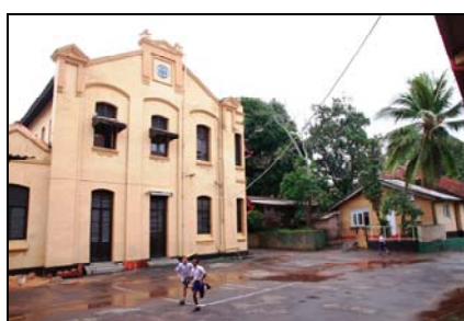
Hostel & Sick Room(back gate)