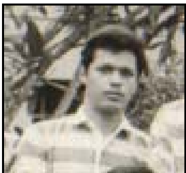
Rugby Team 1967