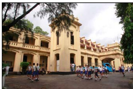
Driveway to Hall