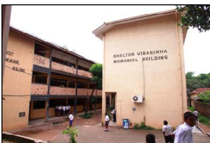
Tennis Court Buildings